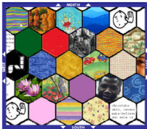
Figure 2. The digital story quilt “top” shows just one side of the patch polygon within a community of other patches.

After creating their personal patch, writers/readers may then construct a quilt top, comprised of the patches of other individuals (Figure 2). Using a peer-to-peer network structure, the digital story quilt interface “on the fly” pulls together individual patches from across a geographically dispersed network. The resulting composite may be dynamically manipulated by the writer/reader to create multiple arrangements of the quilt “faces.”